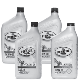
SAVE 40% OR MORE YOUR CHOICE 2.99 Qt. Motor Oil Choose 10W-30, SAE 30, 10W-40 or 5W-30. H 126 680; 153 437; 228 841; 458 174 F12 While supplies las