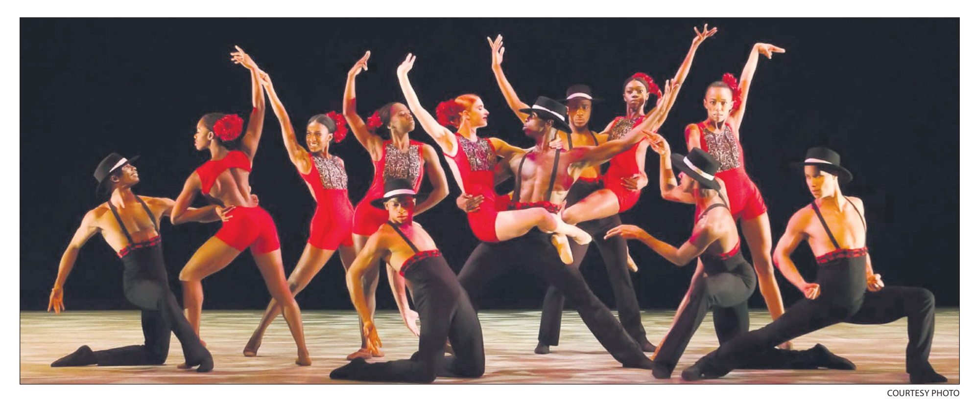
Alvin Ailey's 1960 classic "Revelations" is among the pieces to be performed by Ailey II today at the Aspen District Theatre.