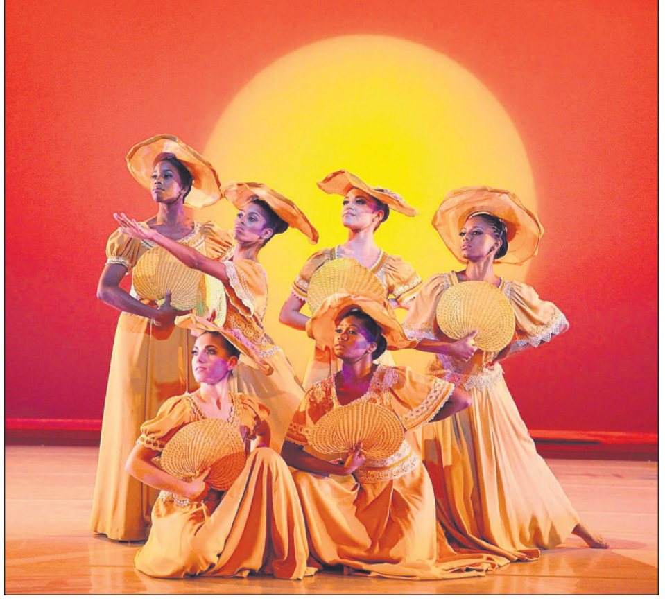
Alley II's "Sketches of Flames."